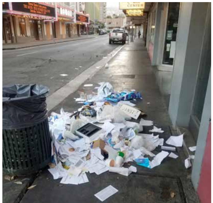
Trash bags torn open on Bethel Street