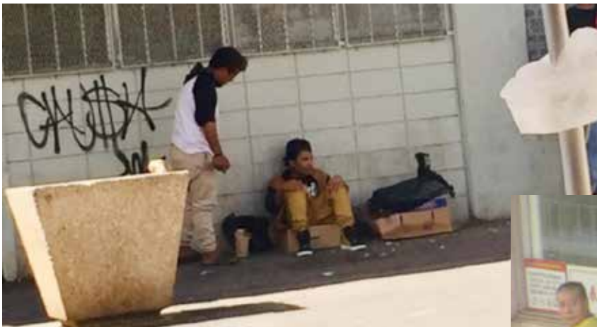
Drinking at Hotel & Kekaulike