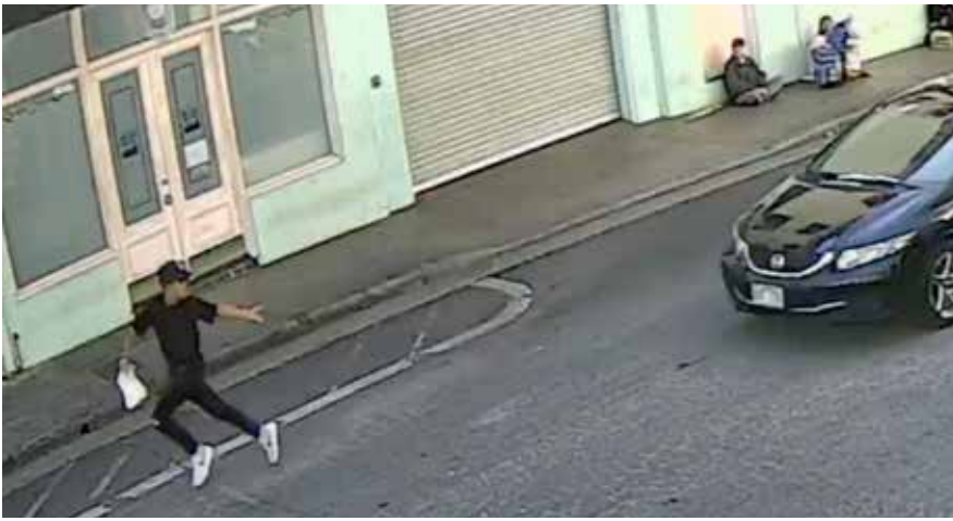
Purse snatching in stolen car on Pauahi Street