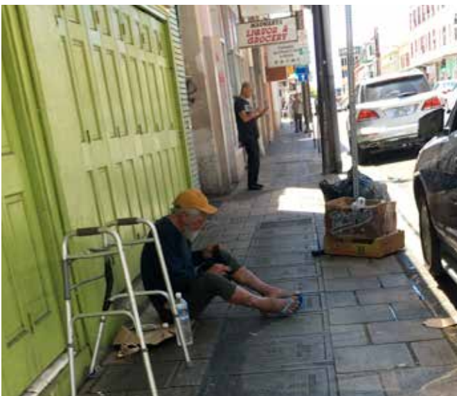
Man drinking alcohol on sidewalk next to Maunakea Liquors for 3rd day, after ambulance ride to hospital