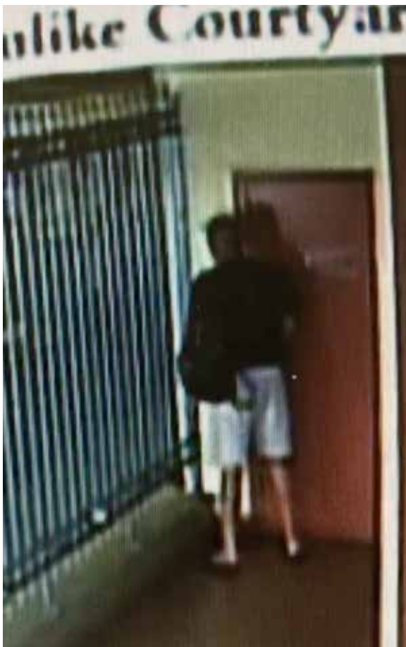
Woman urinating in residential lobby