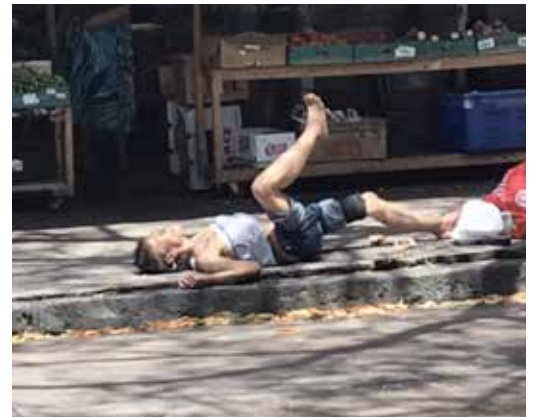
Deranged person writhing on Hotel Street sidewalk at midday