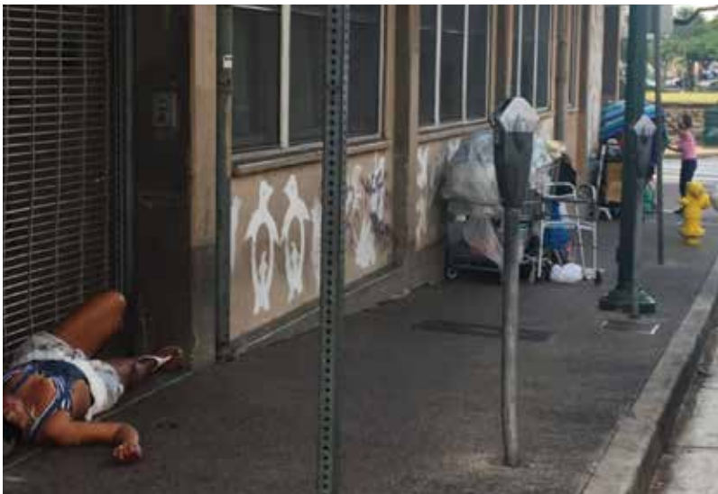
Mid-afternoon at the Pauahi Senior Recreation Center, the City-owned building where senior citizens attend City-run programs such as exercise classes.