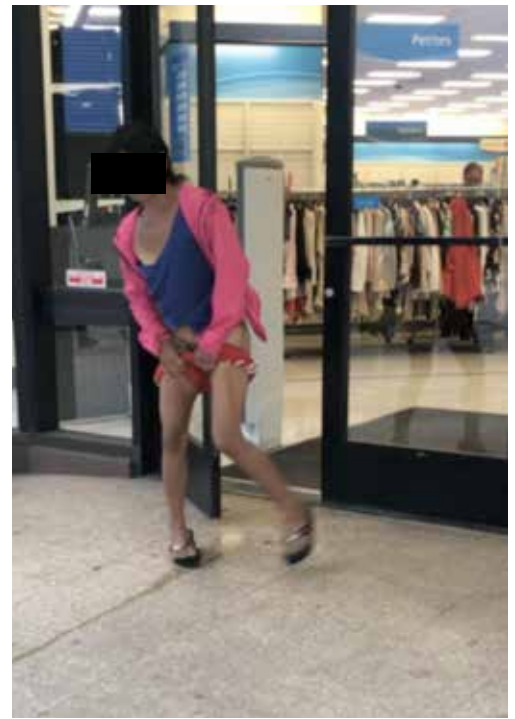
Woman urinating at store entrance