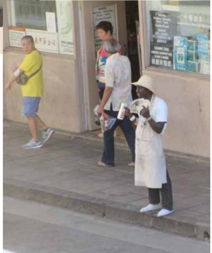
Man with known mental issues shouting and drinking beer next to Maunakea Liquors