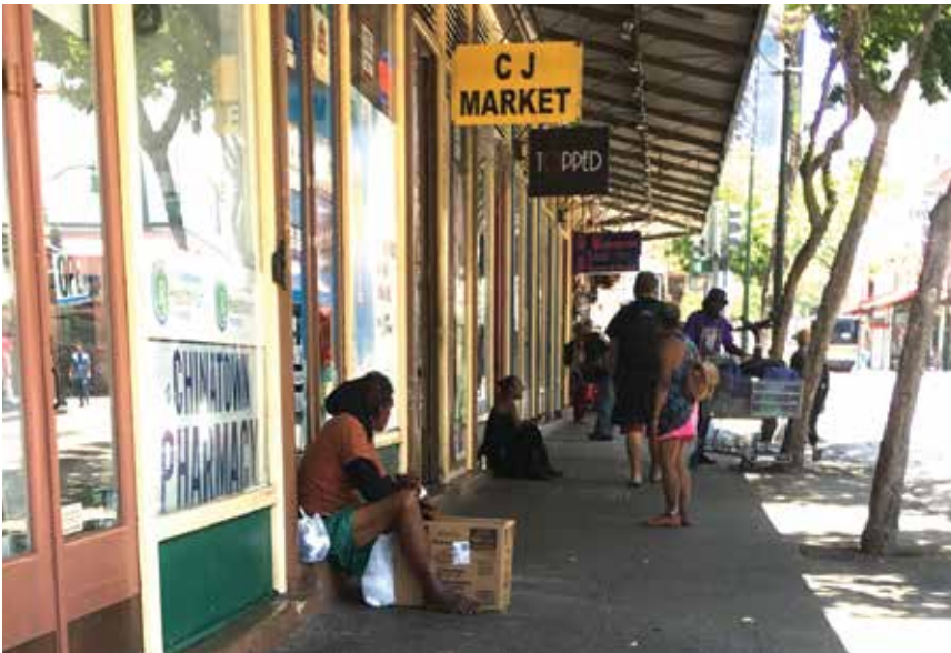
Sit-lie violations & sidewalk obstruction across from Police station