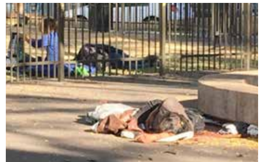
Campers in & around Sun Yat Sen park