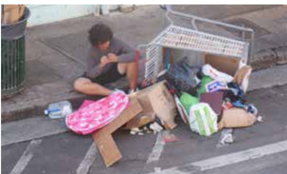
Shopping cart & owner at River of Life