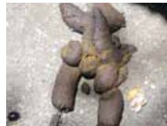
Feces on sidewalk next to restaurant