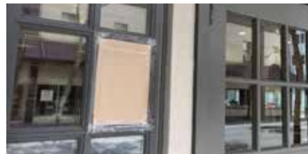
Broken windows at FHB and The Nature Conservancy