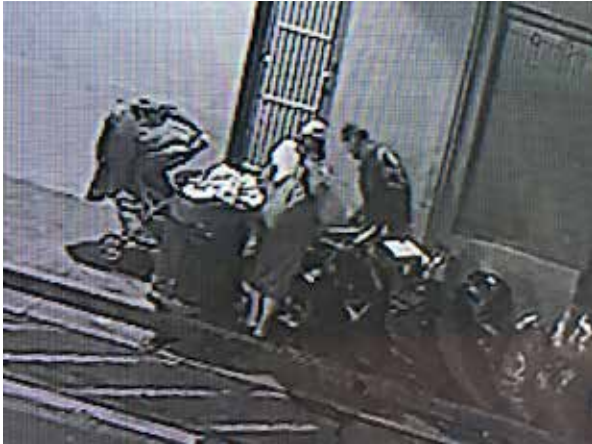
8:42 pm - Homeless people dig through trash pile at River of Life

NOTE: River of Life Mission has the City's permission to continue using standard black trash bags.