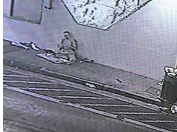
9:22 pm - Mentally ill homeless male uses River of Life trash to make a camp outside River of Life