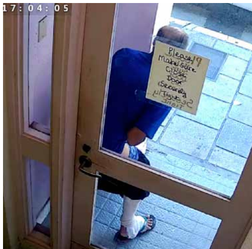
Male defecating in apartment doorway