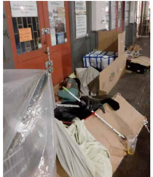
Homeless campers blocking business entrances on No. Hotel St.