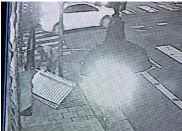
9:30 pm - Mentally ill homeless male gets up from River of Life sidewalk, crosses Pauahi St., tears window guard off of neighbor's building, and smashes the frame with heavy object.