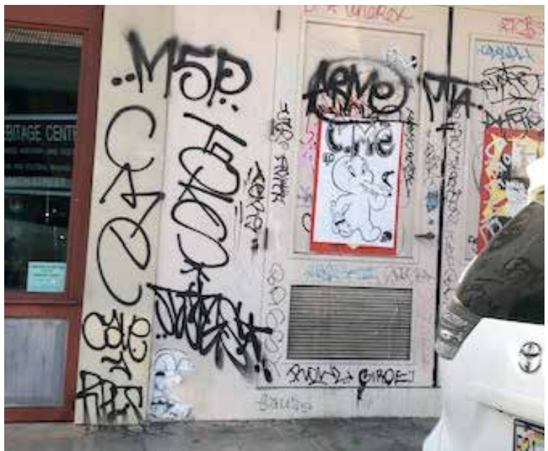
Graffiti on City building on Smith Street