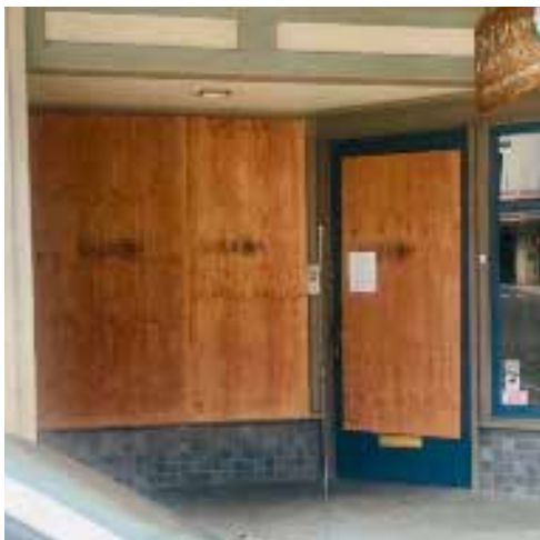
Non-profit's office windows broken again by people who sleep in doorway