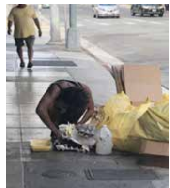
Man eating from trash pile

Any real trash solution has to include defenses against trash pilfering. We encourage the City to explore options such as tamper-proof locking bins and to seek community input.