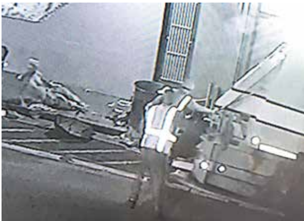
4:25 am - City Refuse crew collects bagged trash, leaves trash that was strewn about by homeless people. Homeless camper looks on.