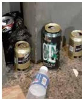
Trash left by campers on No. Hotel