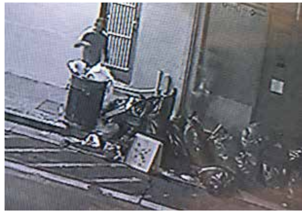
9:36 pm - Mentally ill homeless male who just vandalized building goes back to River of Life, digs through trash and flings it on the ground.