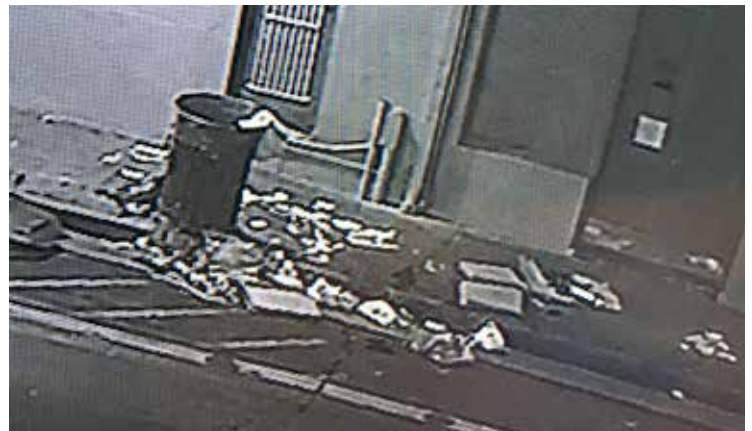
4:30 am - River of Life's unbagged trash, strewn about by homeless people and left by City Refuse crew, greets the new day.