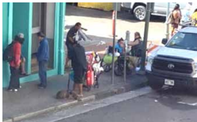
Sidewalk obstruction, public drinking on Pauahi.