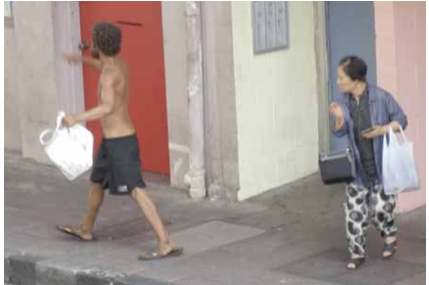
Deranged man's incoherent yelling frightens pedestrian