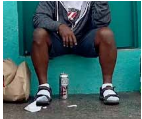
Drinking beer on River of Life doorstep