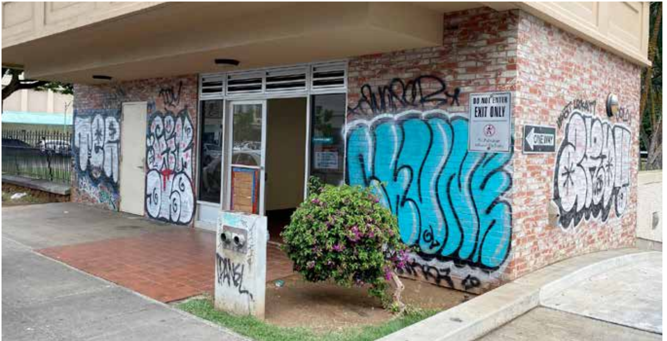
City-owned elevator building at Smith Beretania Park

Community members have noted a sharp increase in graffiti tags around Chinatown. We believe that the City, as one of the largest landowners in Chinatown, should assemble and lead a Graffiti Response Task Force in coordination with other property owners. City Guards on site at City properties would also be a deterrent.