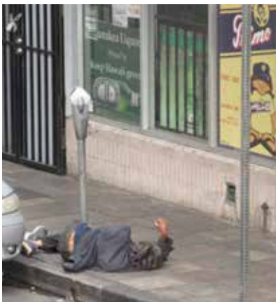
Passed out next to liquor store