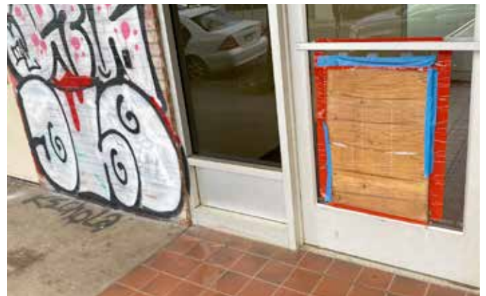
Broken window at tagged City building, above