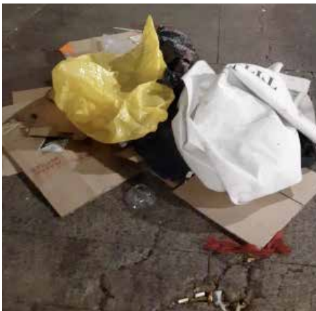
Trash left by campers on N. Hotel

The yellow bags do nothing to solve this problem, for these reasons: Most businesses put out their trash in the evening. City crews pick up the trash at 4 a.m. So the trash sits out at curbside all night. This makes it very convenient for homeless people and others to open, dig through, and dump out the trash bags looking for food, bedding, etc. Further, homeless people occupying doorways, sidewalks, parks, etc. often leave trash such as food waste, human waste, cardboard, clothing, etc. behind them for others to clean up, which the City crews will not collect because it isn't bagged. NOTHING ABOUT THE YELLOW BAGS PREVENTS THIS. Nor are there any consequences for the people who dump the trash, only for the rest of us who must live and work in this environment