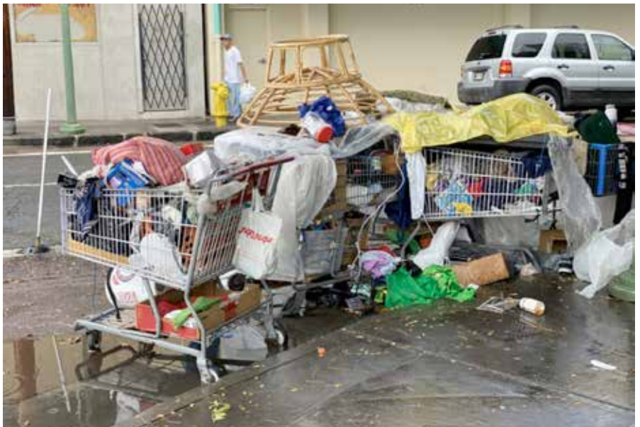
Scene in the bulbout next to Smith Beretania Park