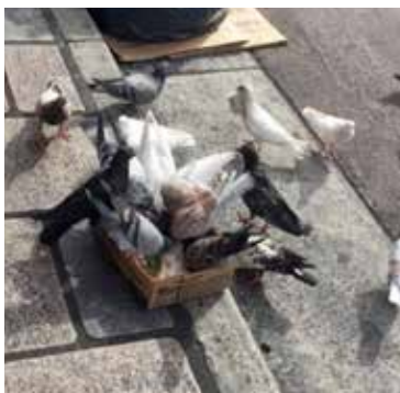
Homeless addict ate lunch on Pauahi St. sidewalk and left his rubbish there.