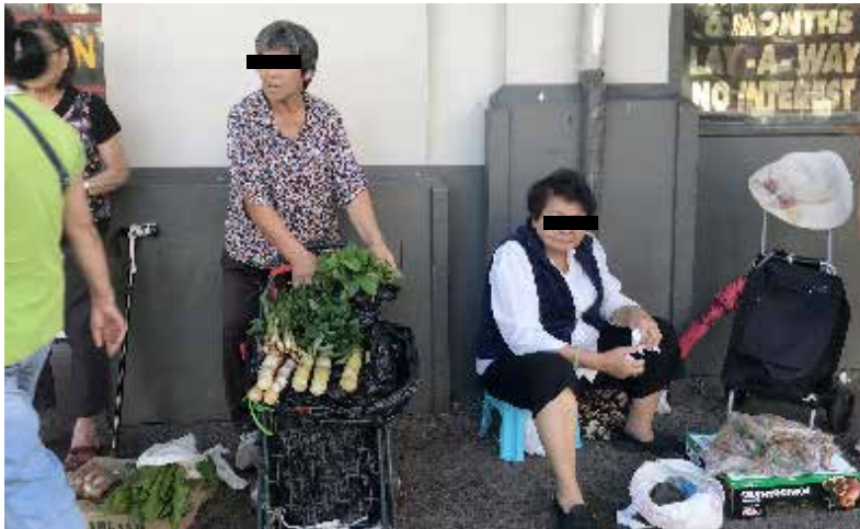
Illegal peddlers on No. Hotel Street