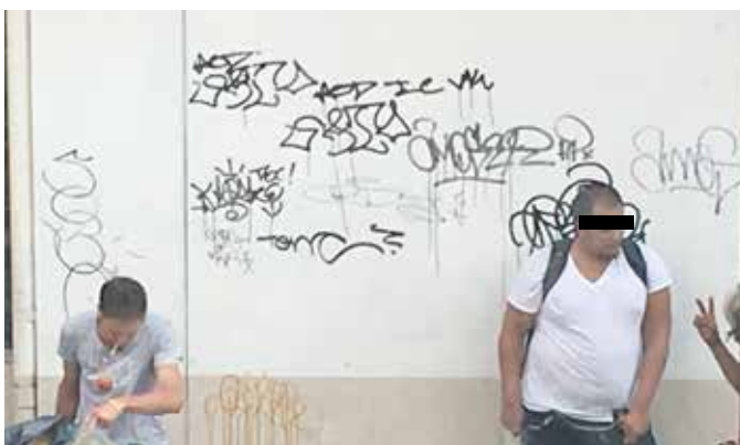
Corner of Maunakea & Pauahi