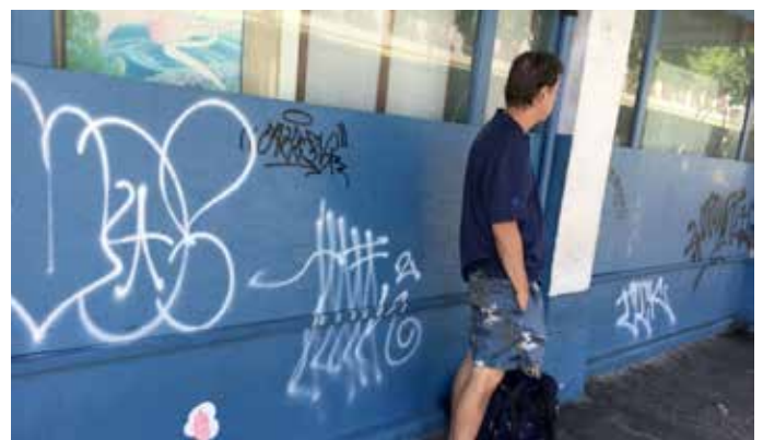
Near bus stop at North Hotel & Smith