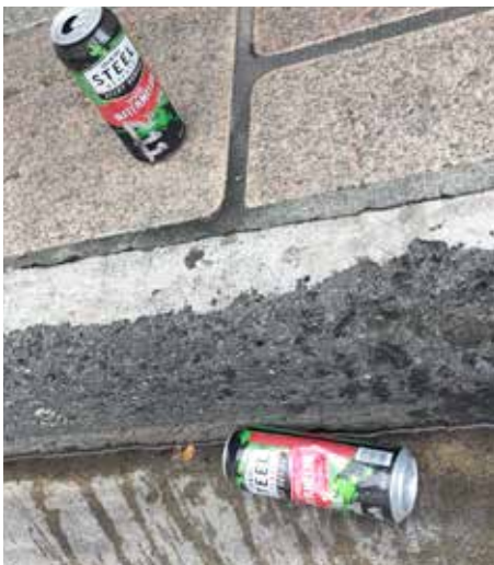
Homeless panhandler in wheelchair drank these beers on Maunakea St. sidewalk and left the cans.