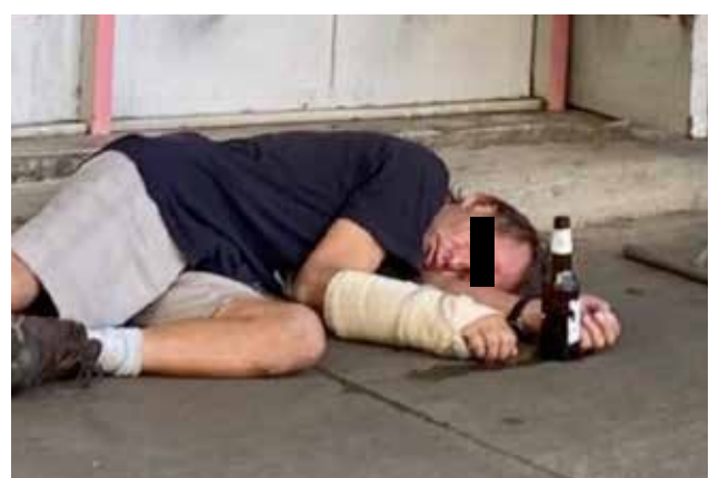
Passed out with beer 1/2 block from liquor store