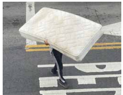
Man dumps used mattress on Pauahi St. sidewalk.