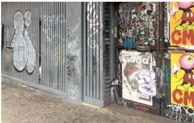
North Hotel Street