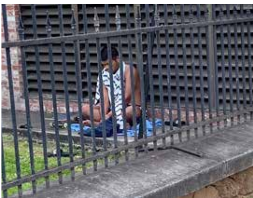
Smoking crack at Smith Beretania Park

A Chinatown Watch member reported on 12/29/19: "Residents who live along the 130-150 block of North Hotel St. notice that some of the 'bedding' and shopping carts are setting up as early as 6:00/8:00p ... The problem is someone decides to get up around 2/3 am and starts to yell, argue and even fight creating loud noise and nuisance heard around the block."