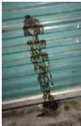
Feces on door