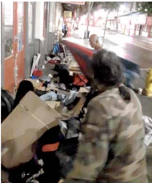
6 am outside City-owned property on No. Hotel Street

We hope for a sustained effort by everyone involved now that the holidays are over. We are grateful for increased HPD presence on No. Hotel, Pauahi, Maunakea & Kekaulike Mall. The long-awaited City Guards will serve a critical role in supporting HPD's efforts. Whereas HPD officers do not stay on site once they've cleared an incident, the City Guards will be posted at the trouble spots for hours-long shifts. This kind of continuity is needed to stop problems before they compound. The lack of a continuous lawful presence is one reason why the public spaces around City properties are some of the most dangerous in Chinatown.